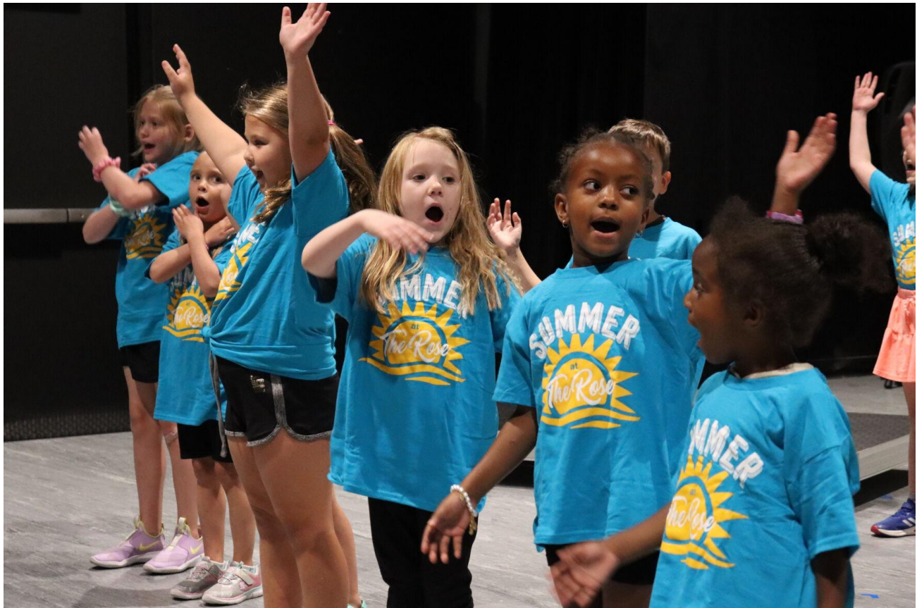
THE ROSE THEATER

Gather information from area organizations about their camp offerings. No matter their interest, there is something that is certain to provide a fun, exciting (and even educational) experience for your kids. Weeklong camps offer an opportunity for kids to explore new interests and try something new. Longer camps allow students a chance to dive deep into a topic they are passionate about and want to learn more. Omaha offers a wide variety of summer camps, from performing arts camps at The Rose, camps to spark the imagination at the Omaha Children's Museum, educational camps with a historic twist at the Durham Museum, outdoor adventures with Boy Scouts and Girl Scouts, Aim for the Stars math and science camps from UNO, and so much more. Most organizations publish their summer camp schedules between January and March, so start watching for this information now.