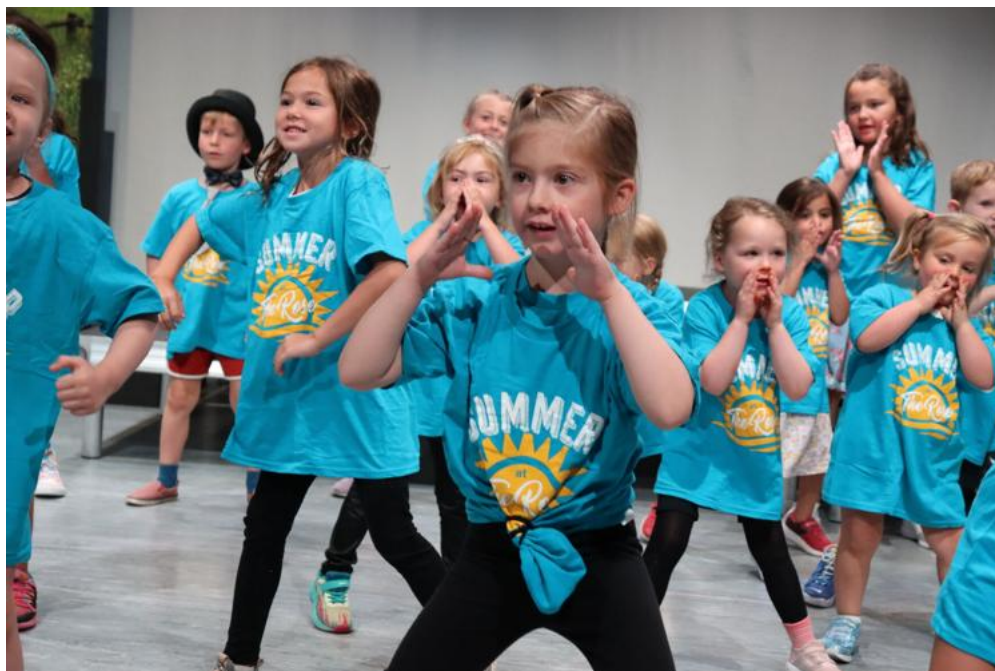
THE ROSE THEATER photos